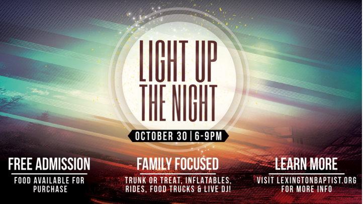
Light Up the Night

Our day is Friday, October 31st. Go to www.40daysforlife.com to sign up for a time slot when you can come.