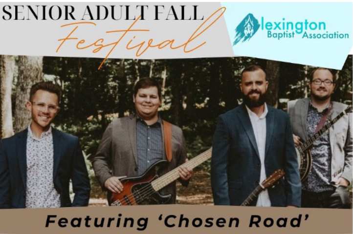
Oakwood Baptist Church

Pray: Pray that all who come feel loved, encounter Jesus, and see His light in our church family.